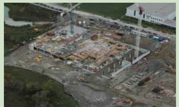
Future site and building of the York Regional Police Investigative Building , located at 47 Don Hillock Drive.